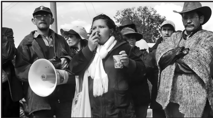
Workers at the Guacari Plantation in Zipaquirá, Colombia on strike in November to protest unpaid wages and benefits. On December 1, the company brought in thugs who beat up the Guacari strikers, intimidating them into resigning and busting their union.

Flower workers on at least four plantations in Colombia went on strike at the beginning of December to protest wage theft by Floramerica-Sunburst Farms, the company that last year bought Dole's flower operation. Workers were also protesting the company's failure to make legally-required payments to the country's health insurance and social security system.